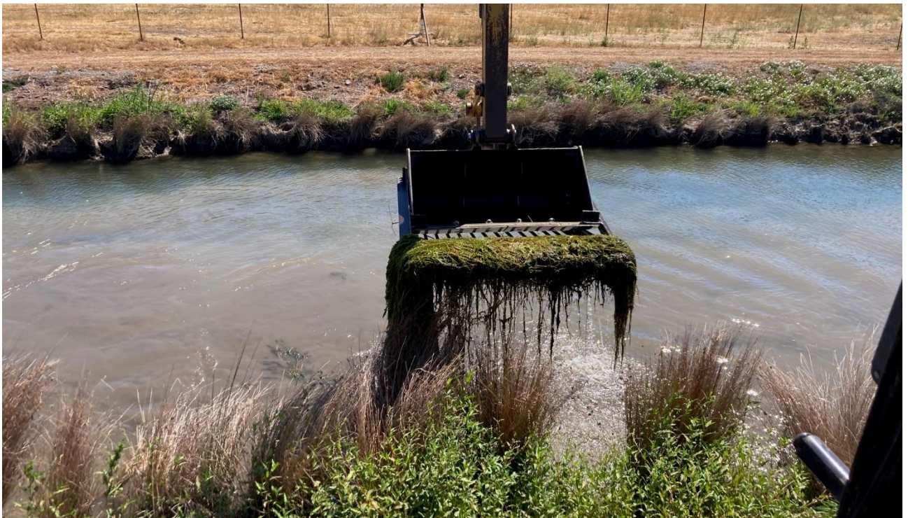
Figure 2. Homemade Vegetation Rake