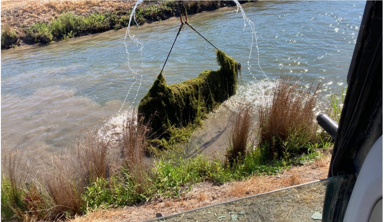
Figure 1. Drag for Aquatic Vegetation