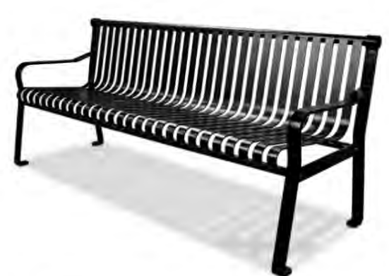
Figure 1. Courtyard Style Bench

The proposed courtyard style bench (Figure 1) is six (6) feet wide, made of metal, provided with a protective coating, and commercial quality. Placement options for the proposed bench include the Administration parking lot, at the entrance to the Administration building, or behind the Administration building and within the pergola area. The proposed courtyard style bench costs between $699 and $1,315, depending on vendor. A separate engraved plate would be purchased and affixed to the bench for a nominal cost.