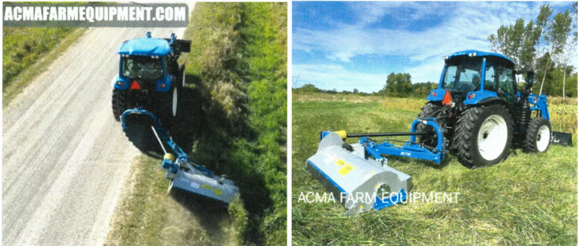
Figure 1. ACMA Ditch Bank Mower